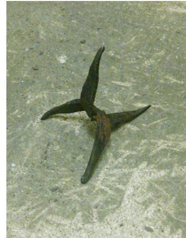
Stars such as this one were used to puncture the tires of nonunion contractor vehicles.